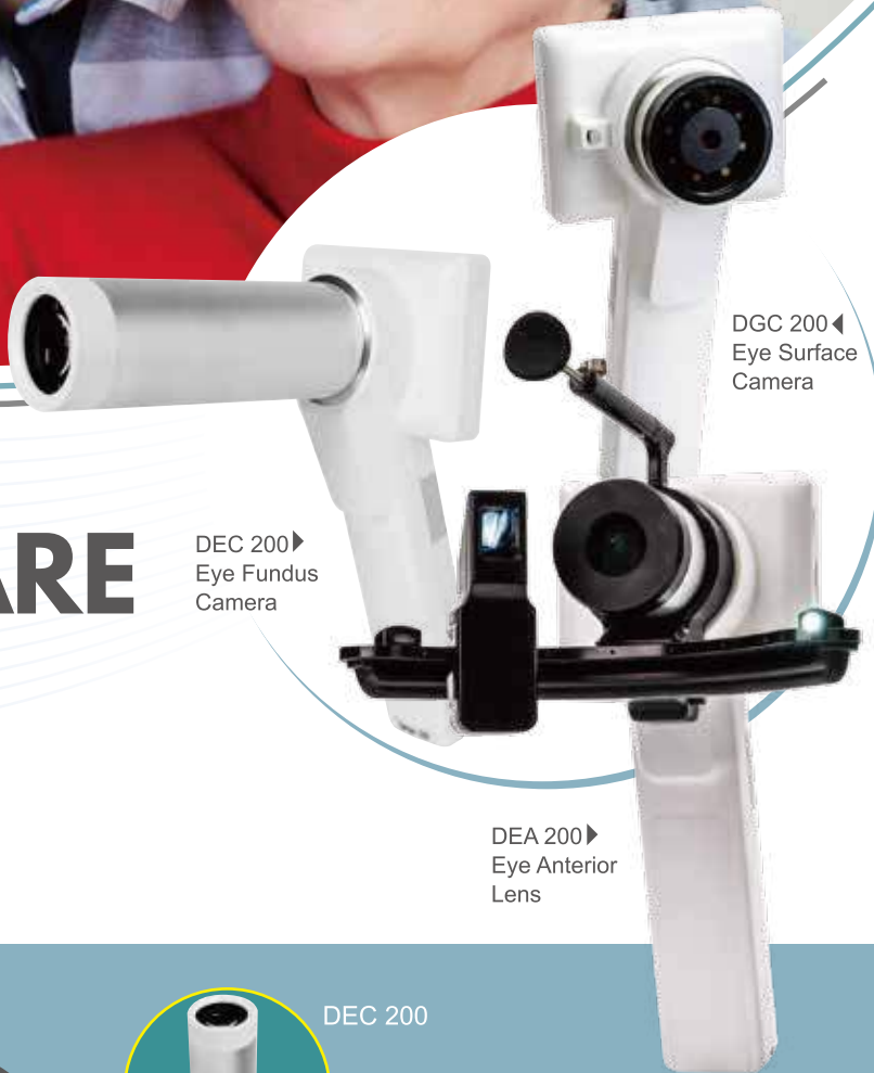
DGC 200 ◀ Eye Surface Camera